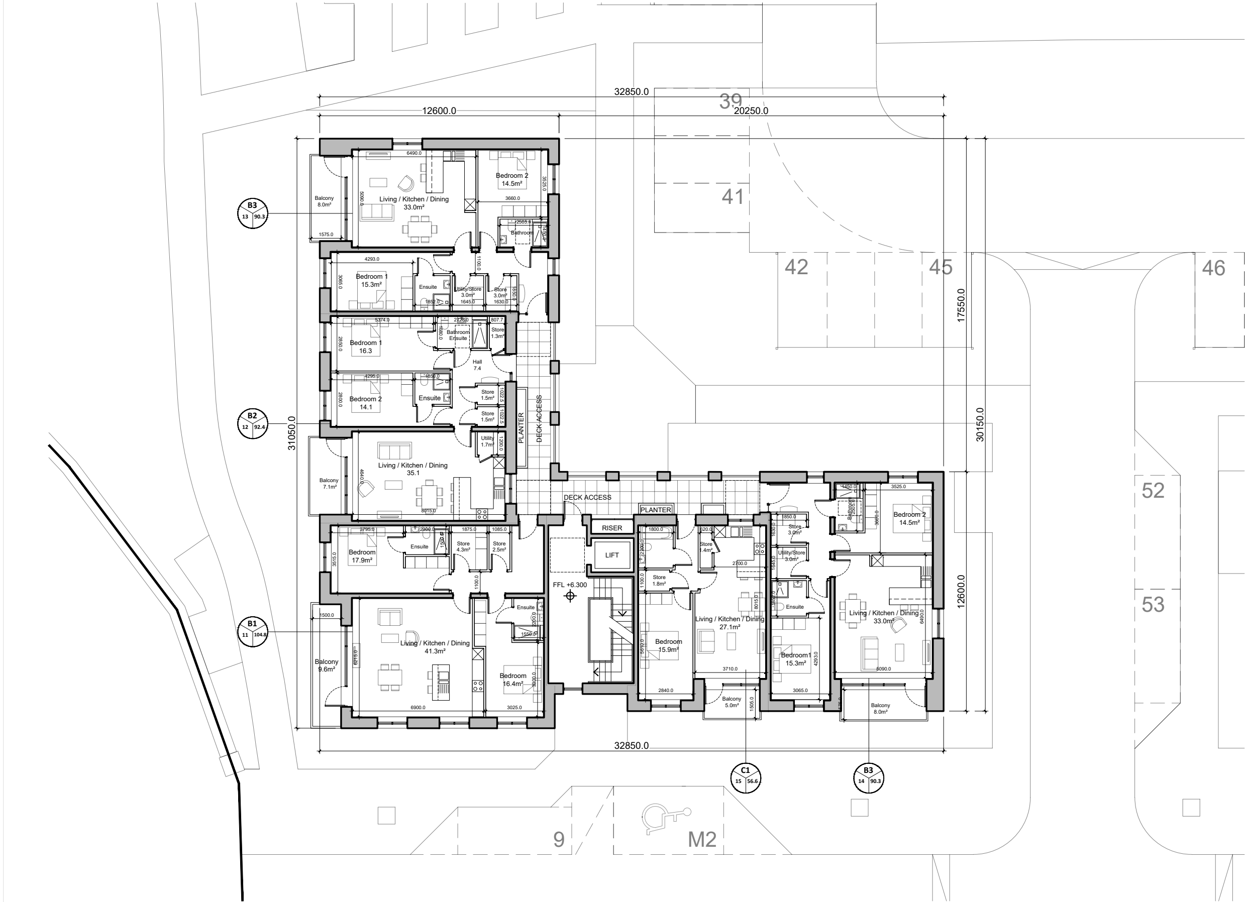
Apartment Block 01 - Second Floor Plan Scale 1:200